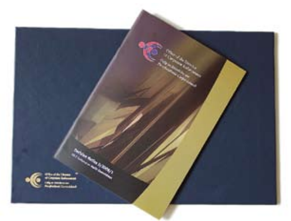
ODCE Guidance on Audit Committees (November 2006)

At year-end, the Minister was considering these recommendations<sup>3</sup>. The Minister will also wish to consider, in consultation the Financial Regulator and the Revenue Commissioners (where appropriate), if additional classes of regulated financial service company or undertaking within the meaning of Article 41(6) of the Directive should be exempted.