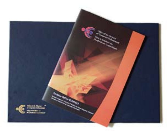
Revised Guidance on Auditor Reporting to the ODCE (December 2006)