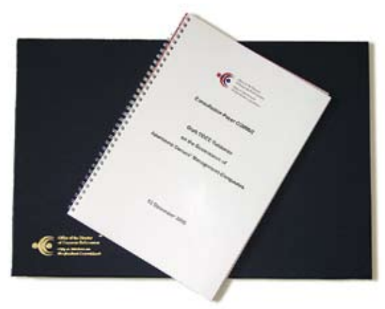
Consultation Paper on Apartment Owners' Management Companies (December 2006)

The second ODCE Consultation Paper issued in 2006 included Draft Guidance on the Governance of Apartment Owners' Management Companies (AOMCs)4. The preparation of this Guidance responded to an increasing number of queries and reports which the Office had received on this subject. It was clear that there was a knowledge deficit of the company law requirements on the part of the directors and members of such companies (i.e., the apartment owners). The Consultation Paper and associated Draft Guidance sought to inform those associated with management companies of best governance practices with a view to improving company performance over time. The Consultation Paper attracted significant media interest on its launch in December 2006, and having taken account of the comments received, the Office intends to publish final Guidance later in 2007.